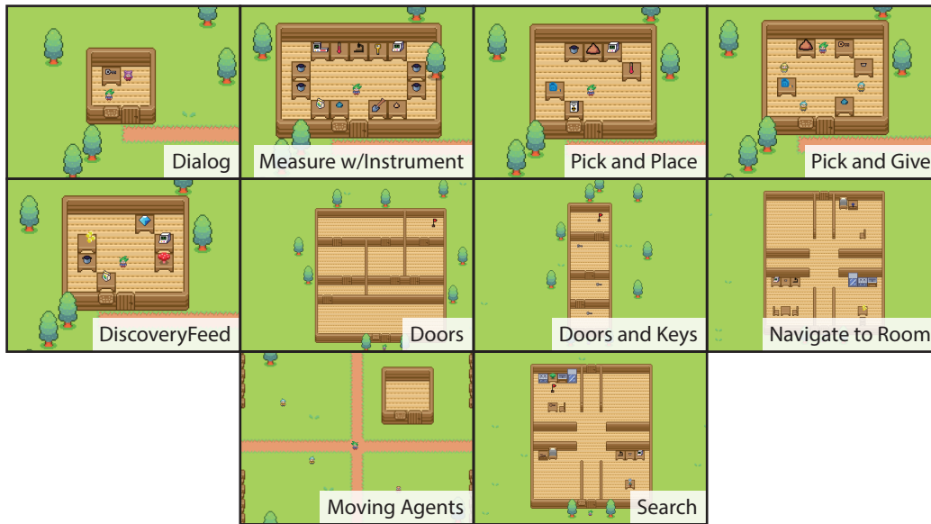
Figure 3: Example instances of the 10 Unit Test themes.