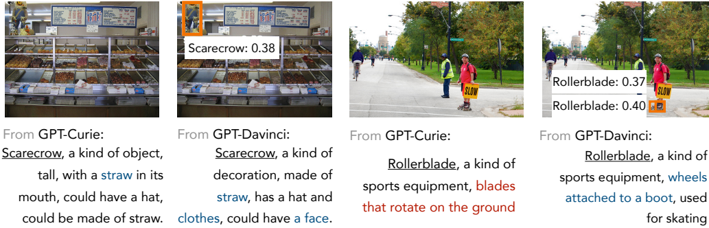
Figure 4: Detection performance of DESC0-GLIP improves when given better descriptions. GPT-Curie is a smaller model than GPT-Davinci; it gives less accurate descriptions for objects.

captions. As shown in Row 4 of Table 3, including negative captions can improve the model detection performance across datasets while preserving its robust contextual comprehension. These results indicate that this technique effectively enhances the model’s ability to grasp the subtleties embedded in the given language descriptions.