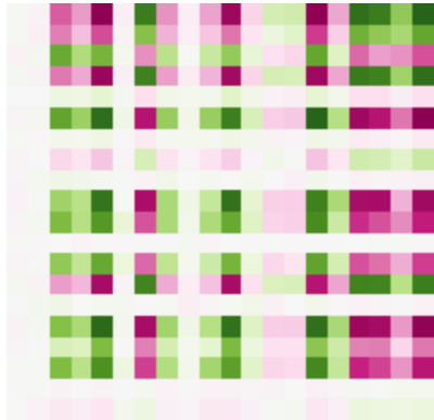
Feature Channel 1