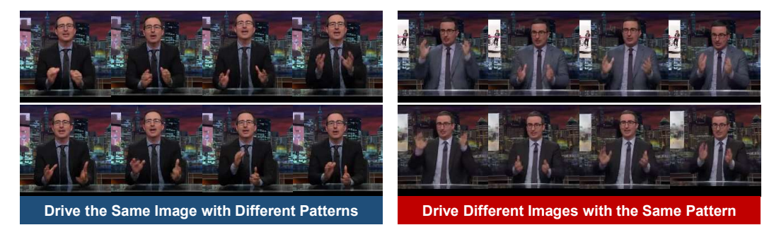
Figure 4: Codebook Analysis. We validate that the codebooks contain meaningful motion patterns.

we achieve comparable diversity result to the ground truth, demonstrating that the quantization design helps to capture common gesture patterns.