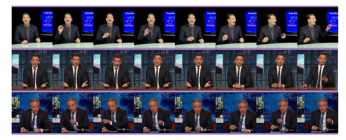
Figure 3: Image sequence results of ANGIE . We show the co-speech gesture image generation results of Kubinec, Seth and Jon, respectively. More qualitative results can be found in demo video.