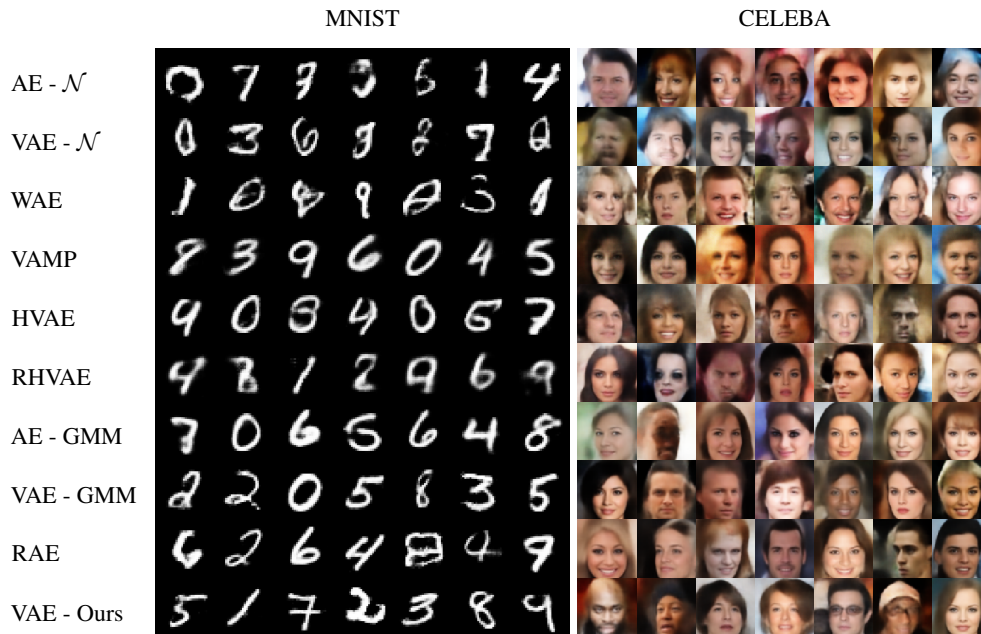
Figure 2: Generated samples with different models and generation methods. Results with RAE variants are provided in Appendix C.