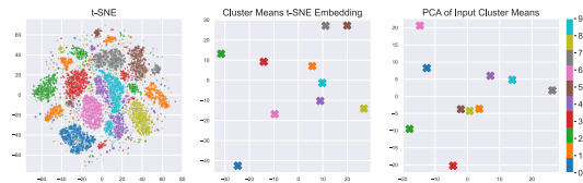
Figure 1: Left: MNIST t-SNE (perp : 30) embeddings initialized with i.i.d \mathcal{N}(0, 1) coordinates. Middle: using these t-SNE embeddings, mean coordinates for each digit are represented. Right: we compute a matrix of mean input coordinates for each of the 10 digits and embed it using PCA. For t-SNE embeddings, the positions of clusters vary across different runs and don't visually match the PCA embeddings of input mean vectors (right plot).

Figure 1 shows that a t-SNE embedding of a balanced MNIST dataset of 10000 samples [14] with isotropic Gaussian initialization performs poorly in conserving the relative positions of clusters. As each digit cluster contains approximately 1000 points, with a perplexity of 30, sampling an edge across digit clusters in the graph posterior \mathbb{P}_{\mathcal{P}_X}(\cdot; \mathbf{K}_X) is very unlikely.