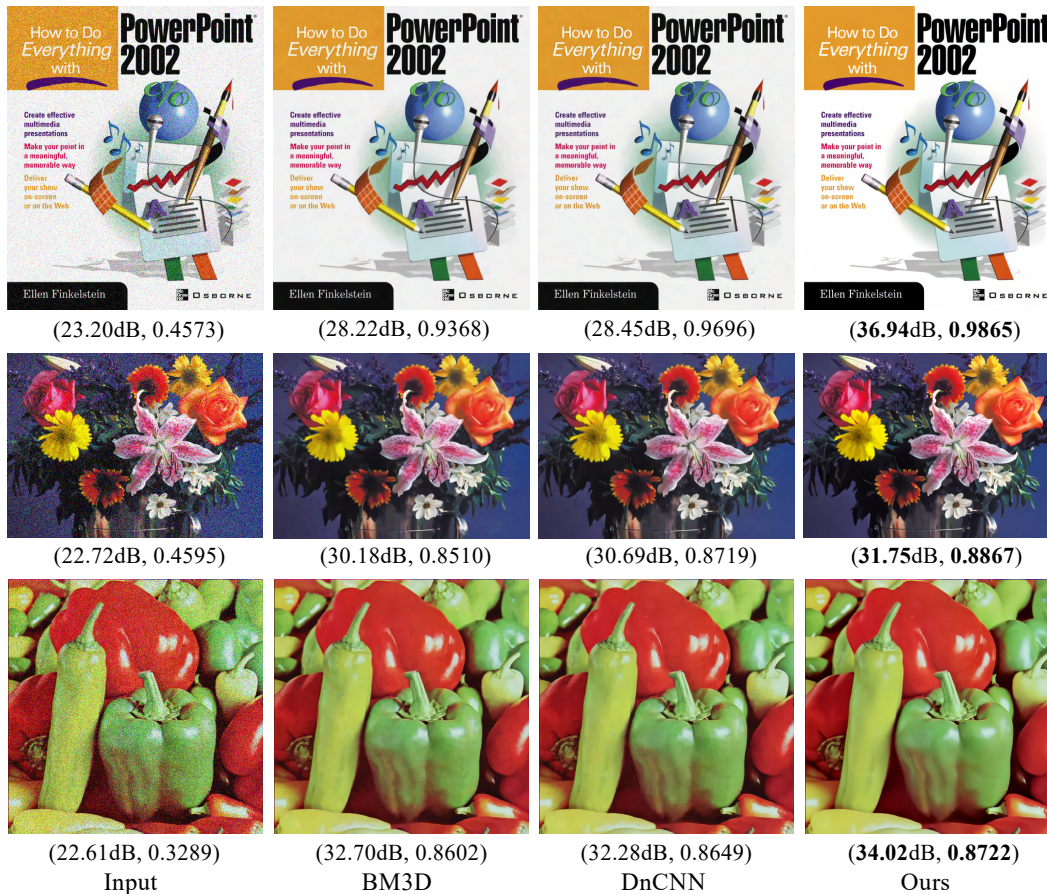
Figure 2: Image denoising examples of Set14. The values beneath images represent the PSNR(dB) and SSIM. The standard deviation of noise is set to 35.

As shown in Figure 2, more denoised examples of Set14 dataset are visualized. Compared with other methods [7, 8], for the first example, our LAPAR restores the original white background color nicely. At the same time, the details of all the pictures are better preserved in our results.