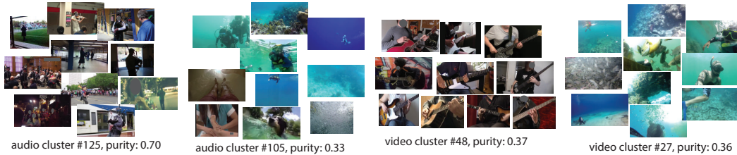
Figure 2: Visualization of XDC clusters on Kinetics videos. The top-2 audio clusters (left) and video clusters (right) in terms of purity w.r.t. the Kinetics labels. Clusters are represented by the 10 closest videos (shown as frames) to their centroid. Interestingly, XDC learned to group “scuba diving” with “snorkeling” (second left, cluster #105) based on audio features and “scuba diving” with “feeding fish” (rightmost, cluster #27) based on visual features. Please refer to our project website for an interactive visualization of all XDC clusters.