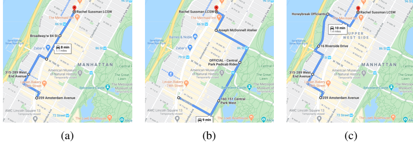
Figure 2: An example of three alternate routes for a query in the New York road network. Routes (b) and (c) have independent travel times after conditioning on the travel time of the canonical route (a).