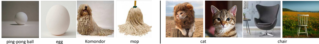
Figure 1: Concepts have different visual and semantic feature space. (Left) Some categories may have similar visual features and dissimilar semantic features. (Right) Other can possess same semantic label but very distinct visual features. Our method adaptively exploits both modalities to improve classification performance in low-shot regime.

suggests that semantic features from text can be a powerful source of information in the context of few-shot image classification.