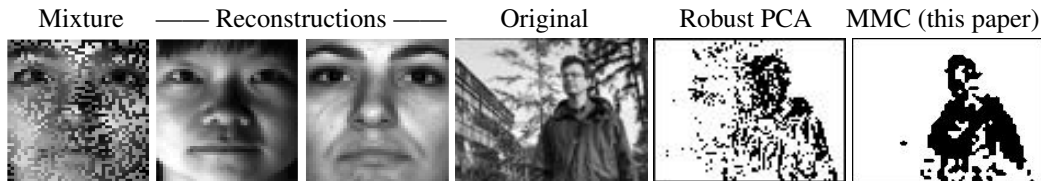
Figure 3: Left 3: Reconstructed images from a mixture. Right 3: Original frame and segmented foreground.

To obtain Figure 2 we replicated the same setup as above, but with data generated according to the HRMC and LRMC models. Hence, we conclude that the performance of AMMC (in the more difficult problem of MMC) is comparable to the performance of state-of-the-art algorithms for the much simpler problems of HRMC and LRMC.