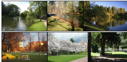
Figure 1: Images from SUN 397 [29] illustrating class ambiguity. Top: (left to right) Park, River, Pond. Bottom: Park, Campus, Picnic area.

As the number of classes increases, two important issues emerge: class overlap and multi-label nature of examples [9]. This phenomenon asks for adjustments of both the evaluation metrics as well as the loss functions employed. When a predictor is allowed k guesses and is not penalized for k - 1 mistakes, such an evaluation measure is known as top- k error. We argue that this is an important metric that will inevitably receive more attention in the future as the illustration in Figure 1 indicates.