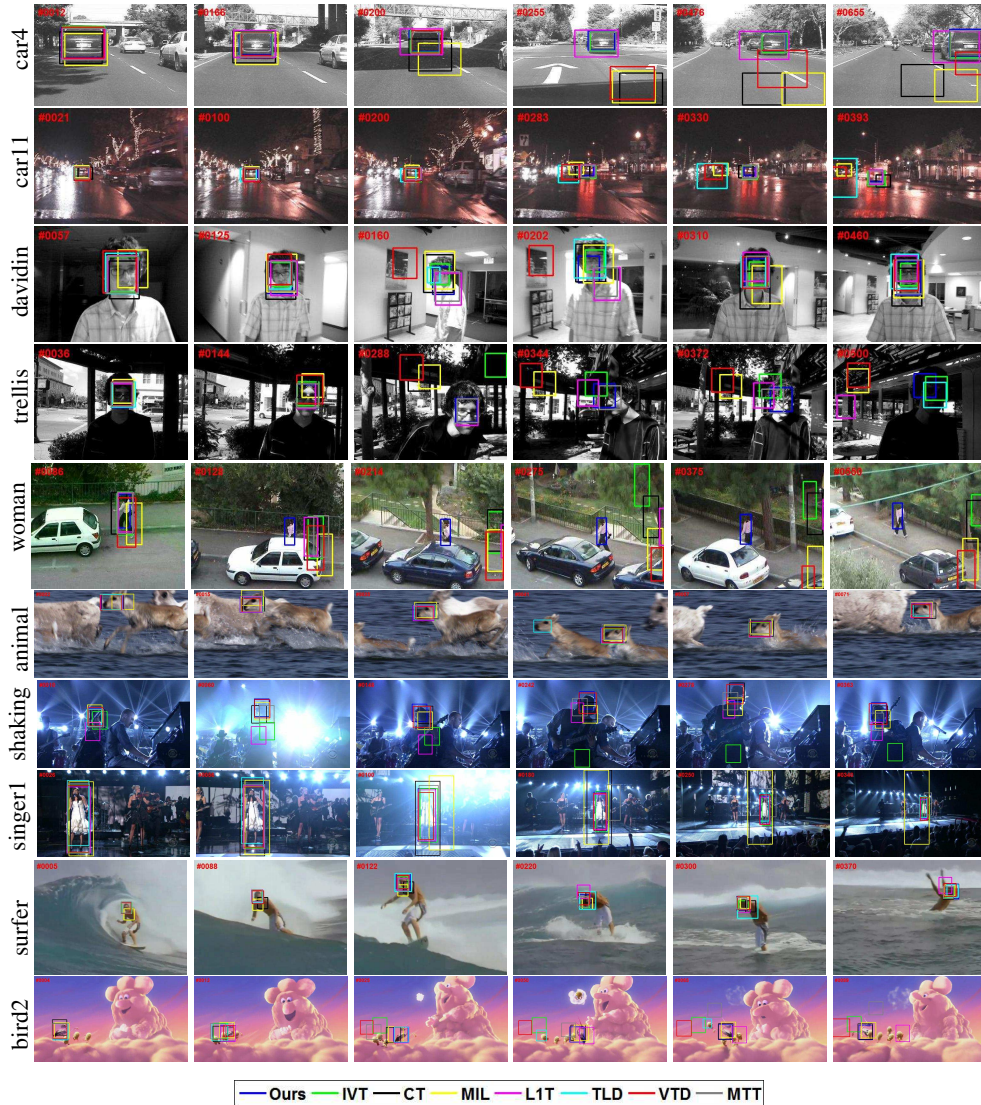
Figure 4: Comparison of 8 trackers on 10 video sequences in terms of the bounding box reported.

during the online tracking process to train a classification neural network to distinguish the tracked object from the background. This can be regarded as knowledge transfer from offline training using auxiliary data to online tracking. Since further tuning is allowed during the online tracking process, both the feature extractor and the classifier can adapt to appearance changes of the moving object. Through quantitative and qualitative comparison with state-of-the-art trackers on some challenging benchmark video sequences, we demonstrate that our deep learning tracker gives very encouraging results while having low computational cost.