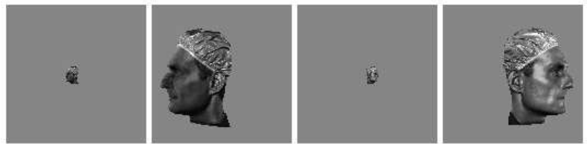
Figure 2: A set of 2000 face images were randomly generated, varying independently in two parameters: distance and left-right pose. The four extreme cases are shown.